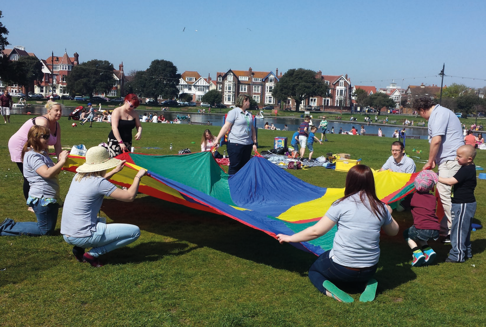
Playing the parachute game with families to encourage play, communication and social development

Training Links UK builds on Learning Links' years of experience in assessing skills needs, designing, delivering, accrediting and verifying training, to deliver a bespoke and flexible service to businesses which enables previously lower skilled people to progress within work and enable local businesses to improve their productivity.