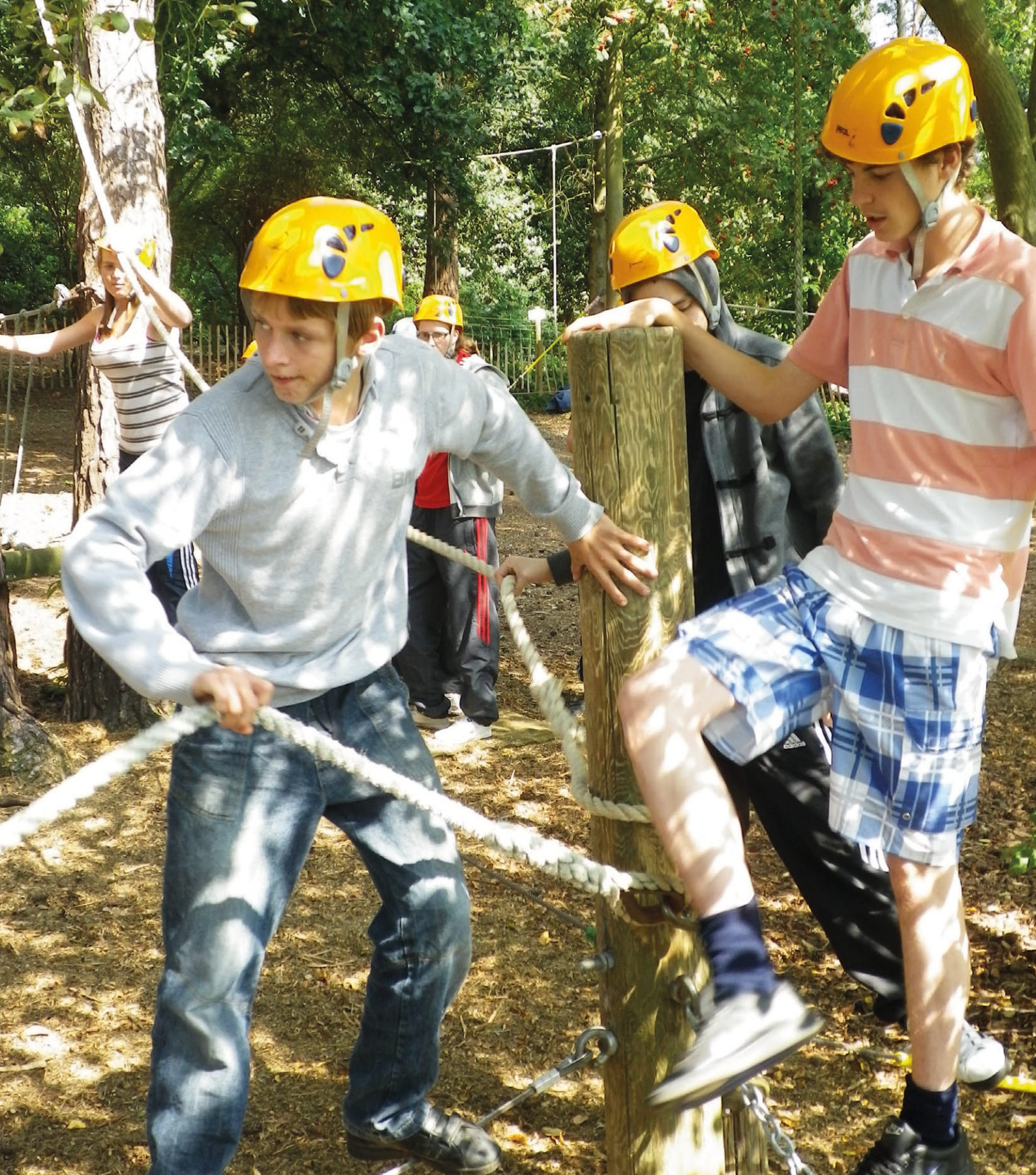
Havant Summer activities

In 2014 the business expanded to create Portsmouth's Community Cycle Hub on Winston Churchill Avenue. The Bicycle Recycling business is now turning over £240k per annum and it has created 42 employment and volunteering opportunities providing work and training for local young people.