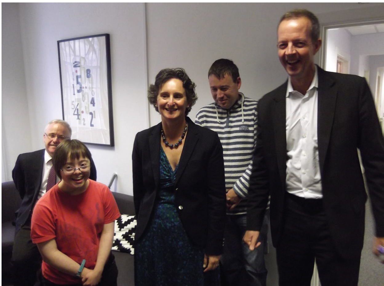
Minister Nick Boles and local MP Flick Drummond meet Esther from the team of our Ventures Books and Bites

With three main fields of business; support for start-ups who approach us; a pipe line of our own innovations designed to respond entrepreneurially to pressing social and economic challenges; and a high profile national thought-leadership programme. Contributors to our work include; the Chief Executive of Portsmouth City Council, the leader of Southampton City Council, the