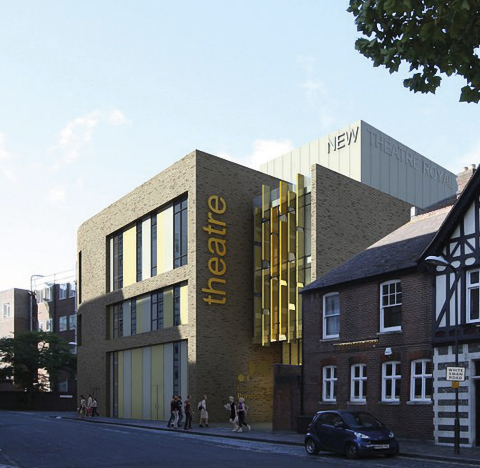
An artists impression of the redevelopment in partnership with University of Portsmouth

confidence. We provide creative workshop opportunities and training in both on and offstage skills. We have recently set up a Creative Lab – a space for local professional artists and creative practitioners.