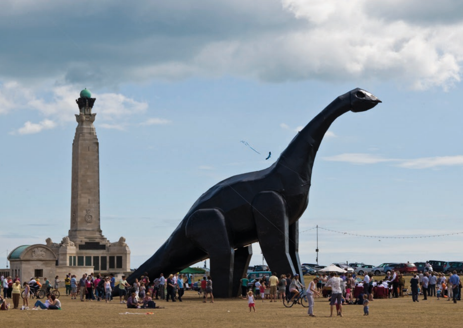
Luna Park' by Heather & Ivan Morison, sited on Southsea Common, 2010

More than 600,000 people saw Luna Park, the dinosaur sculpture sited on Southsea Common by Aspex in 2010 getting the city international media exposure.